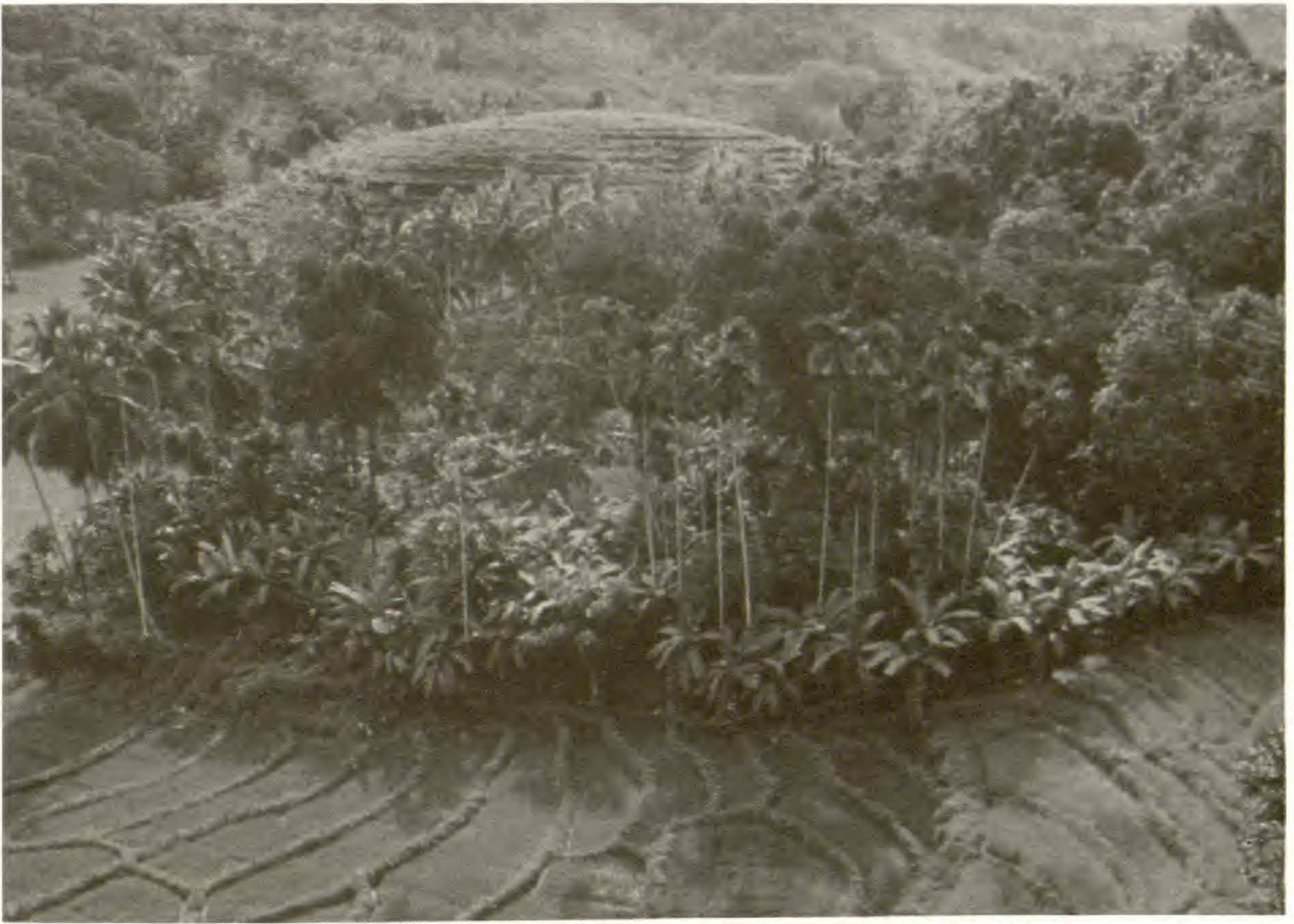
FIG. 3.—A species diverse, uneven-aged forest garden in highland Sri Lanka.

In Sri Lanka kitul palms are common in the mid and low country interior up to 1,500 m. In the lowlands, the palms occur predominantly in the natural forest. In contrast, in the largely deforested mid-elevation highlands palms are managed in small holder forest gardens. These planted gardens are dense stands of uneven-aged, mixed species of perennials surrounding individual family homes (Fig. 3). The gardens are on average less than 0.5 ha in size and typically include 25–35 different species of woody perennials, along with many herbaceous and annual plants. Density of trees is high, ranging from over 350 individuals per 0.5 ha in the intermediate rainfall zone represented by Welimada Division, to 500 per 0.5 ha in a high rainfall area such as Kotmale Division (Everett 1993). Tree canopies on adjoining plots commonly blend together into neighborhood patches of forest-like vegetation.